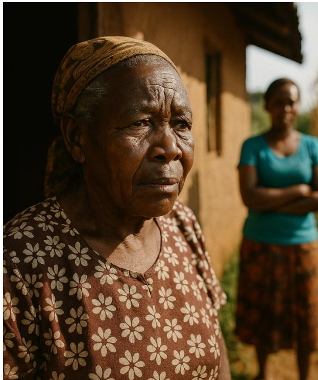
A Depiction of JK and Her Daughter-In-Law

neighbour, a woman who has seen too much loss, and still wakes up every day to feed her chickens and tend her crops.