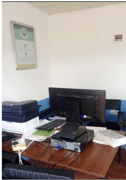
Justice Nest: Mombasa Office