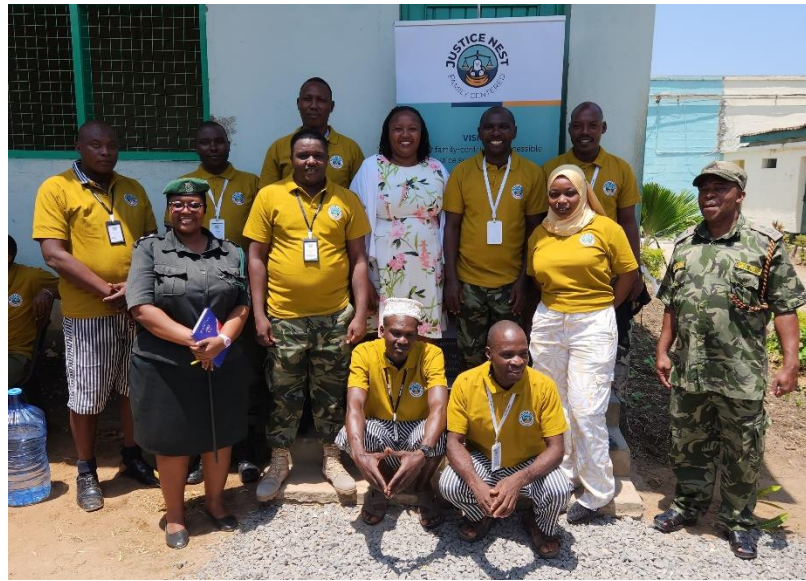
Shimo La Tewa Medium Prison Office & Team

Here, we listen. We don't judge. We act.