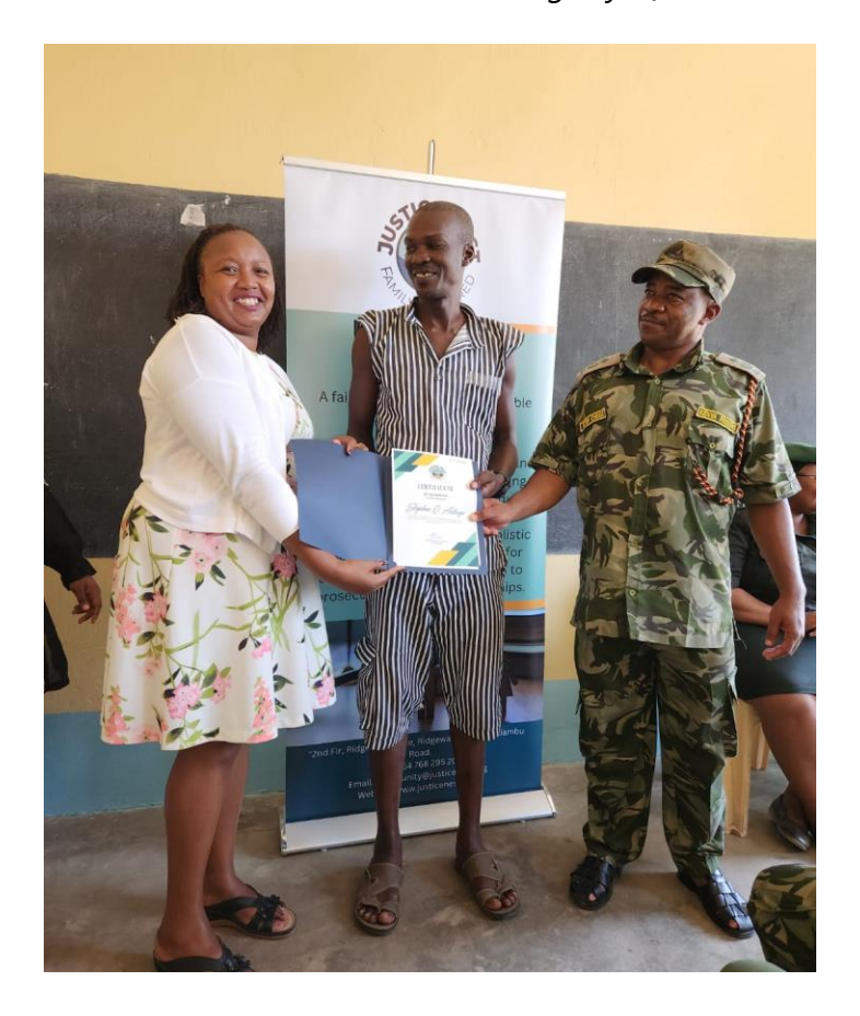
Pic: A free man!!!!!

And the impact didn't stop at graduation. Since the training, twenty-eight(28) prisoners have been released, thanks to the legal knowledge and advocacy skills they gained. One of our graduates was among them, a moment that brought tears of joy to our team. "I never thought this day would come," he said. "This training gave me the tools to fight for my freedom, and now I can start rebuilding my life."