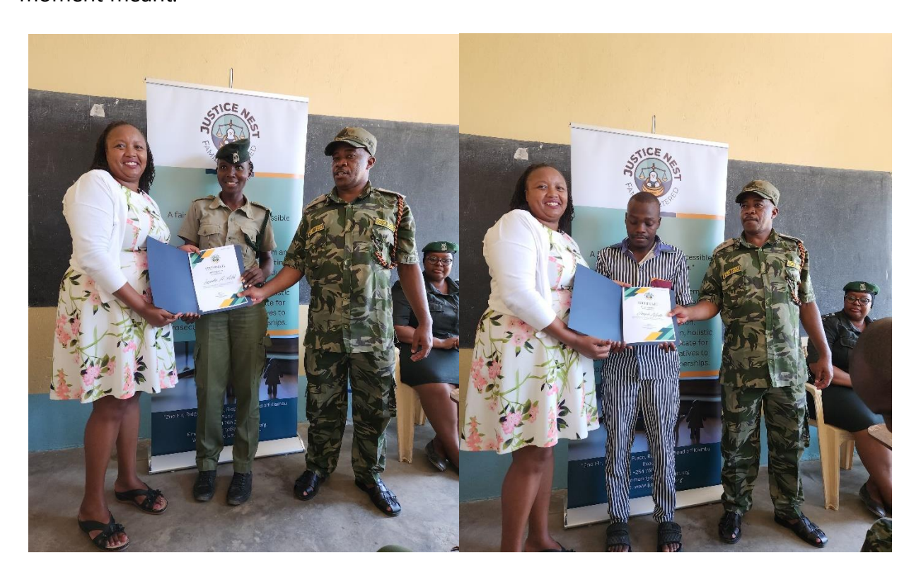
Pic: Paralegal Trainees Receiving their Certificates

The graduation ceremony was the culmination of this incredible journey. The room was filled with a sense of pride and accomplishment as each participant received their certificate, marking their official graduation as paralegals. For many, it was the first time they had been recognized for their achievements in years. The smiles on their faces, the tears in their eyes, and the applause from their peers made it clear just how much this moment meant.