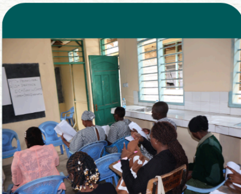
Prison Paralegal Training Program

True giving is about sharing love and hope, not just the amount we give. This Anniversary Fundraising, let's open our hearts and join hands to create a world where compassion leads the way and every gift brings hope for a brighter tomorrow.